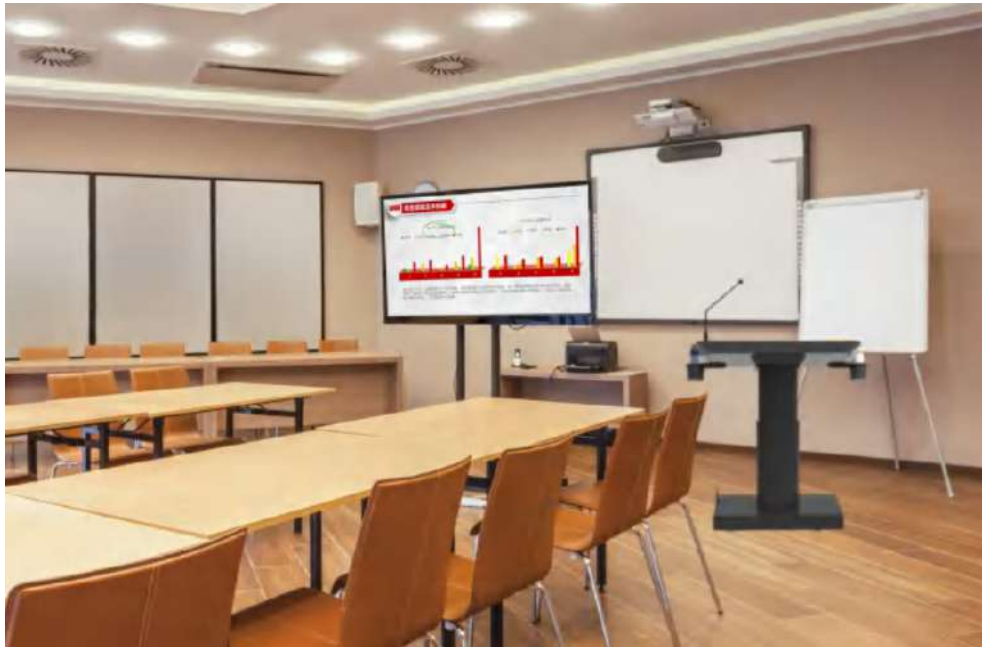
Small Conference Room