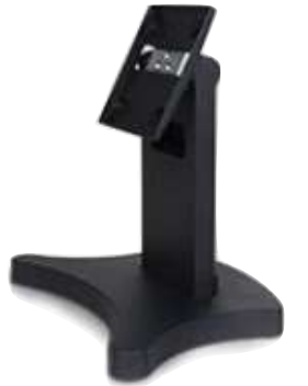
A. Metal Base