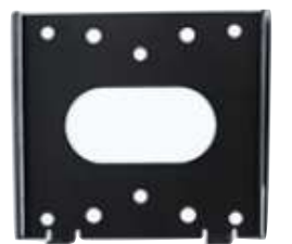
C. Wall mounted