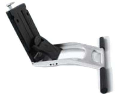
B. Folding Base