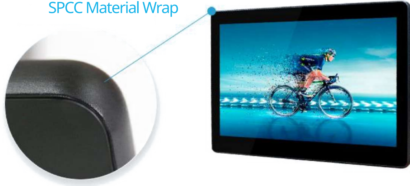
SPCC Material Wrap